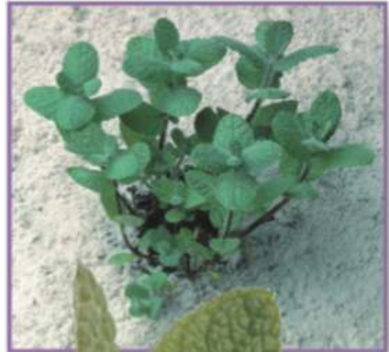
* Apple Mint

Whole plants are cut as flowering begins, and leaves are cut during the growing season and used fresh or dried.